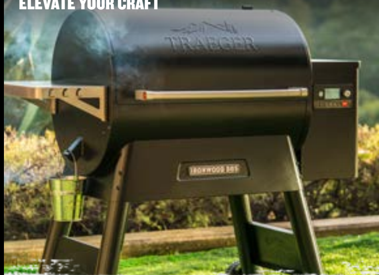
IRONWOOD885 WITH WiFIRE® TECHNOLOGY