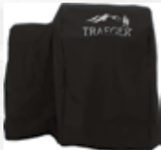
FULL LENGTH GRILL COVER - TAILGATER