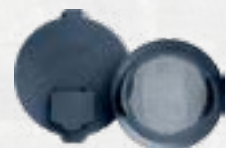
PELLET LID & FILTER KIT