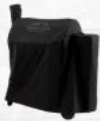
FULL LENGTH GRILL COVER - PRO PRO 22 | PRO 34 PRO 780 | PRO 575