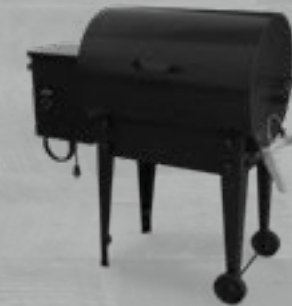
NEW TAILGATER 20

FEATURES: Digital Meat Probe - Precise temperature readings Keep Warm Mode - Ensures food is ready when you are EZ-Fold Legs - Simple to transport and stow Arc Controller - Maintains consistent temperature