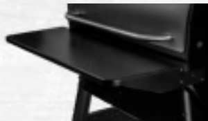
FOLDING FRONT SHELF PRO 575 | PRO 22 | IRONWOOD 650 PRO 780 | IRONWOOD 885 PRO 34 | TAILGATER