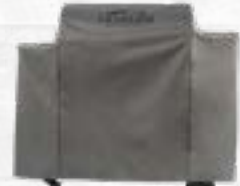
FULL LENGTH GRILL COVER - IRONWOOD IRONWOOD 650 | IRONWOOD 885