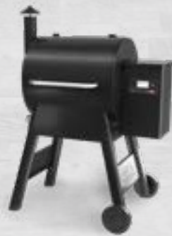
PRO575 WITH WiFIRE® TECHNOLOGY ALSO AVAILABLE IN BRONZE

FEATURES: WiFIRE® - Control grill from anywhere Temperature Range - 165 – 500°F Digital Meat Probe - Precise temperature readings Hopper Clean Out - Switch pellets quickly D2® Controller w/ TurboTemp - Gets hotter, faster