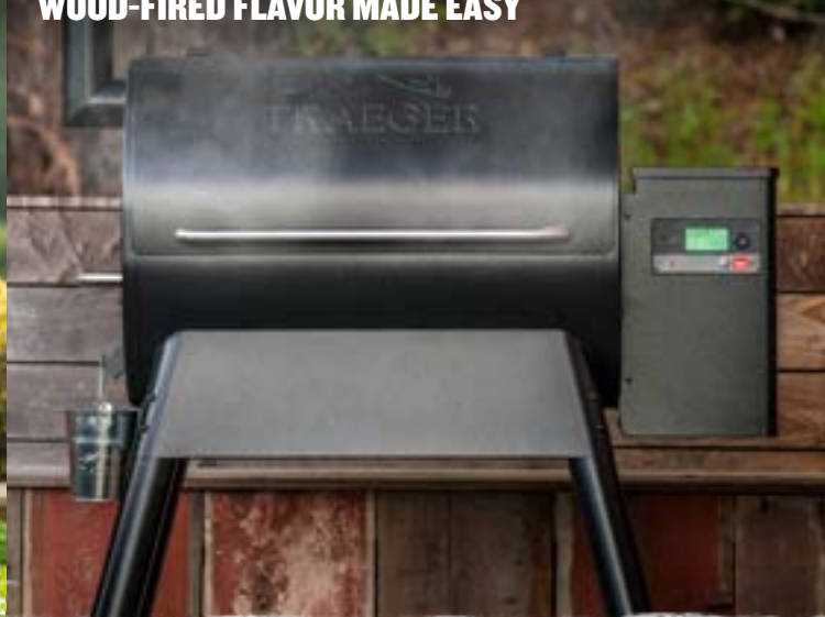
PRO780 WITH WiFIRE® TECHNOLOGY ALSO AVAILABLE IN BRONZE