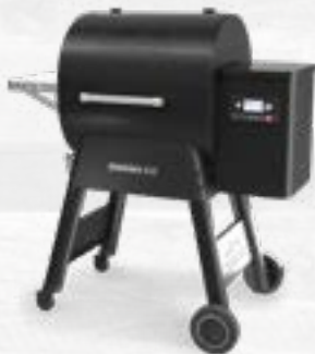
IRONWOOD650 WITH WiFIRE® TECHNOLOGY

WiFIRE® - Control grill from anywhere Double Sidewall Insulation - Precise temperature readings Consistent temperatures in any weather Temperature Range - 165 – 500°F Traeger Pellet Sensor - Remotely monitor fuel level NEW Stainless Steel Side Shelf