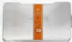
DRIP TRAY LINERS (5 PACK) AVAILABLE FOR ALL GRILL MODELS