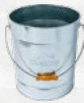
TRAEGER PELLET STORAGE BUCKET